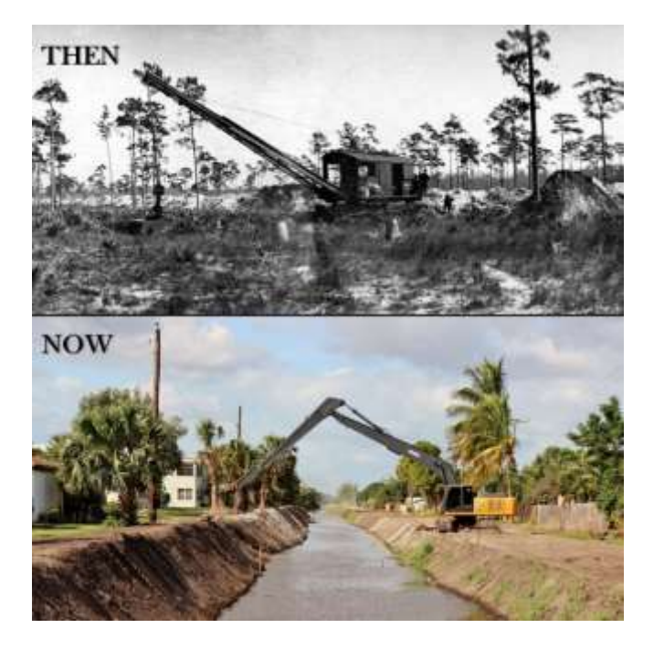
Lake Worth Drainage District maintenance equipment