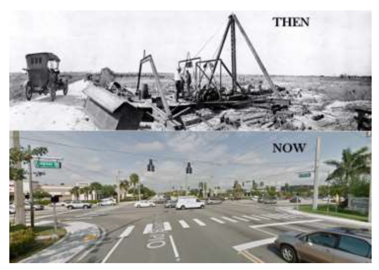
Old Boynton Road, Boynton Beach, Florida